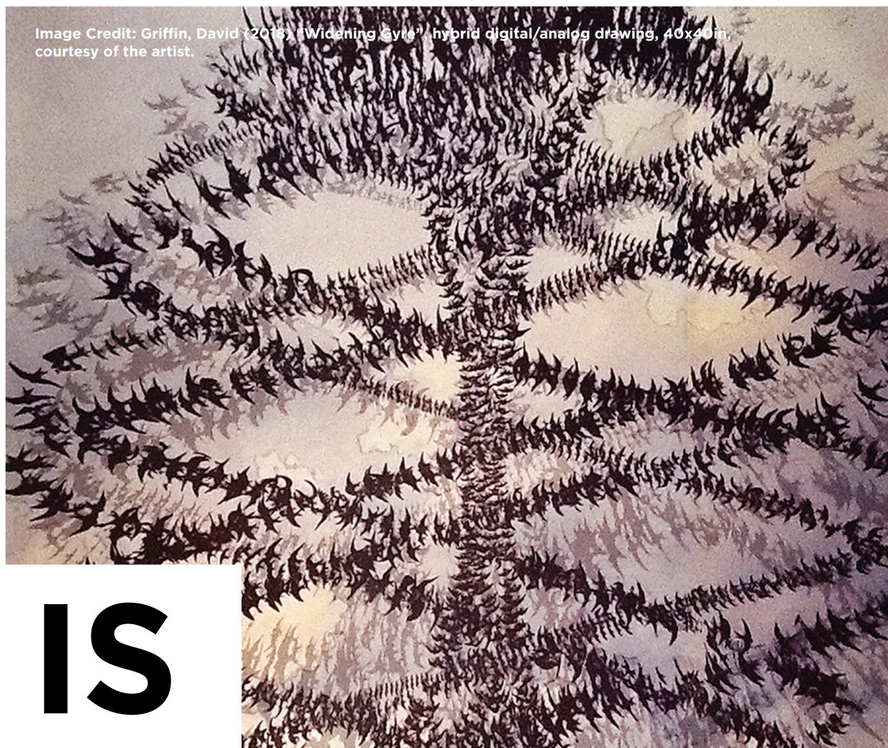
Image Credit: Griffin, David (2018) "Widening Eye", hybrid digital/analog drawing, 40x40in, courtesy of the artist.