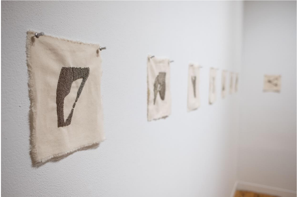
Installation Image: Olivia Whetung, tibewh , 2017.