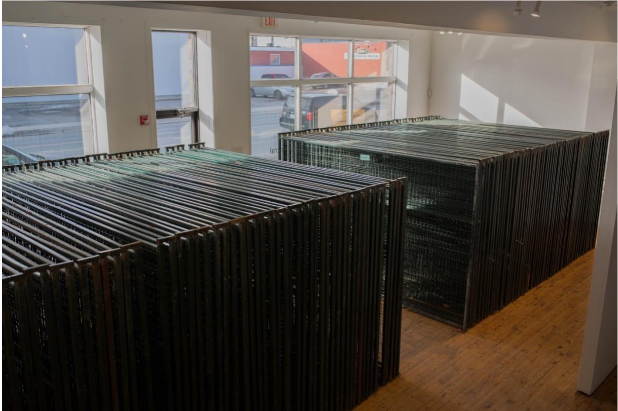
Figure 2. Sheena Hoszko, Central East Correctional Centre , 2016.

Installation Image: Sheena Hoszko, Central East Correctional Centre (2016). Rented security fencing. Fencing equals perimeter of the Canadian Border Services Agency detention centre in Lindsay, Ontario.