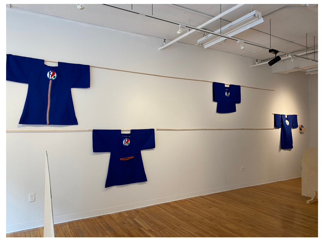
Figure 8. Uniforms for Utopia (2020), installation view March 16.