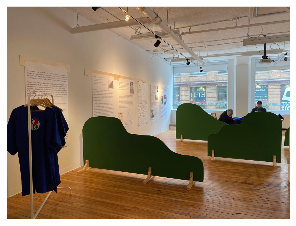
Figure 5. Uniforms for Utopia (2020), installation view March 16.