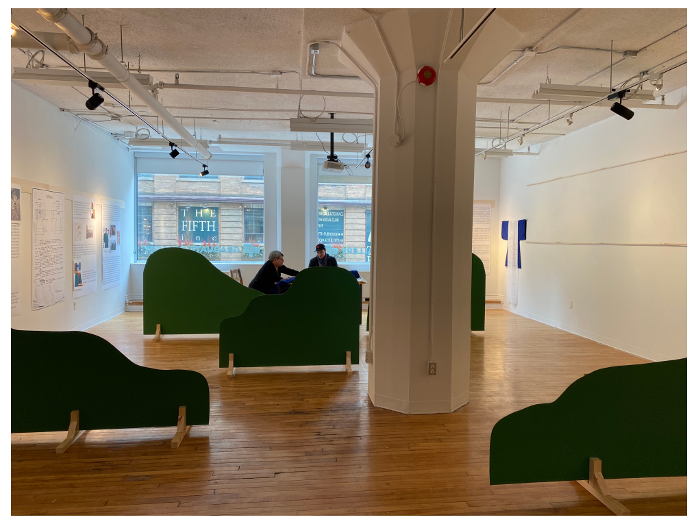
Figure 3. Uniforms for Utopia (2020), installation view March 16.