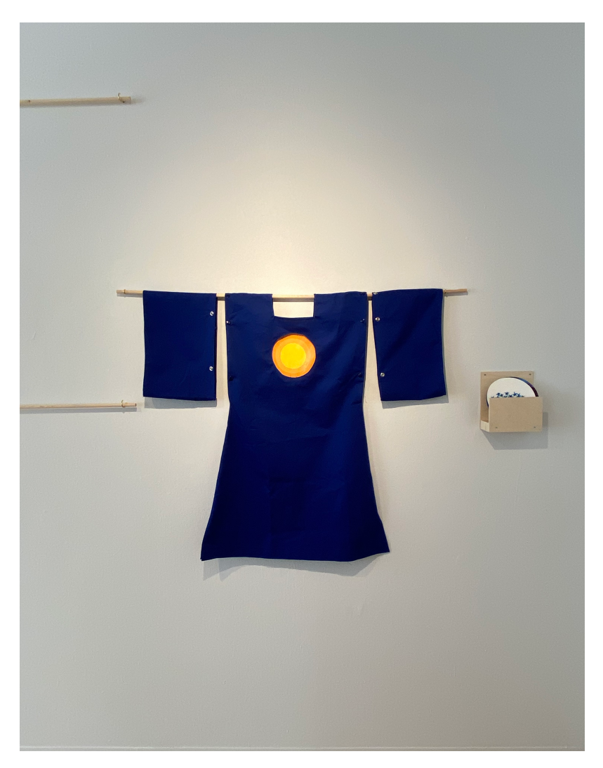
Figure 10. Uniforms for Utopia (2020), artist interpretation by Sonia Prancho March 16.