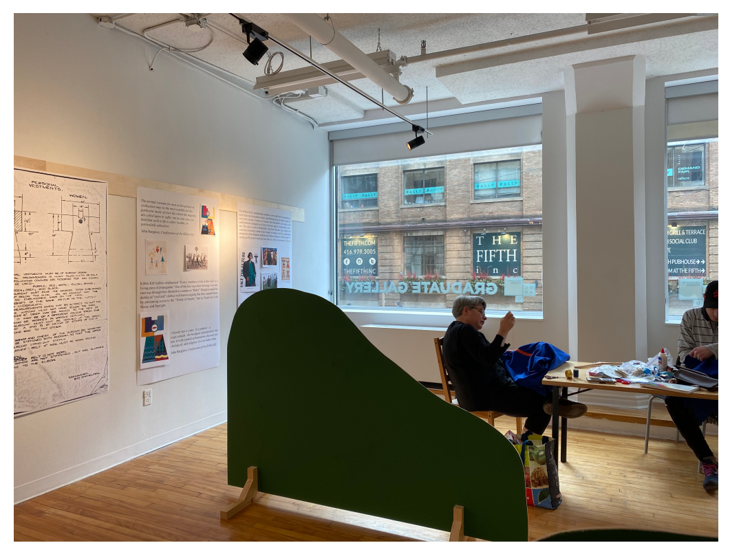
Figure 7. Uniforms for Utopia (2020), installation view March 16.