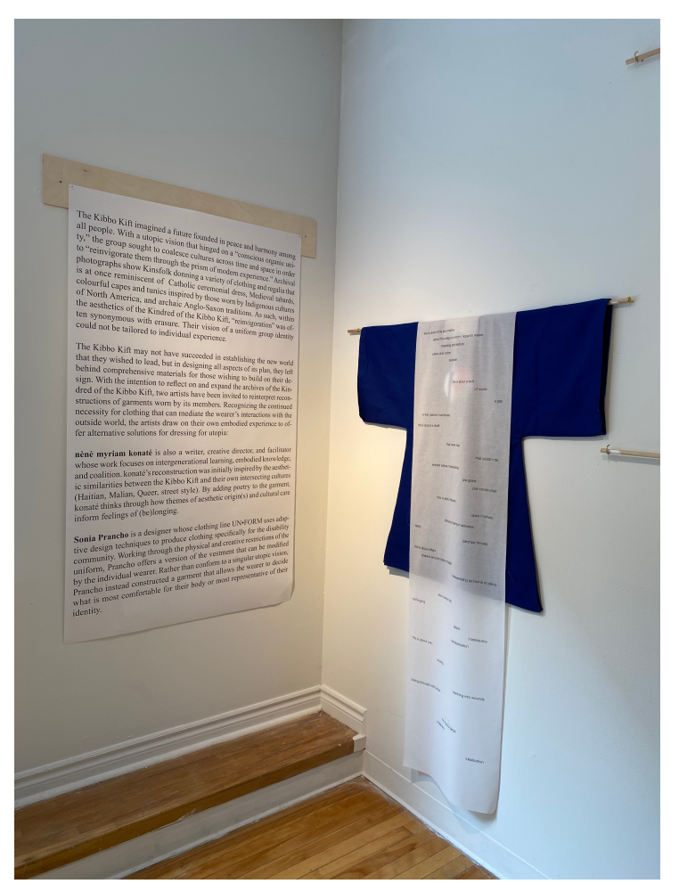
Figure 6. Uniforms for Utopia (2020), artist interpretation by nènè myriam konaté March 16.