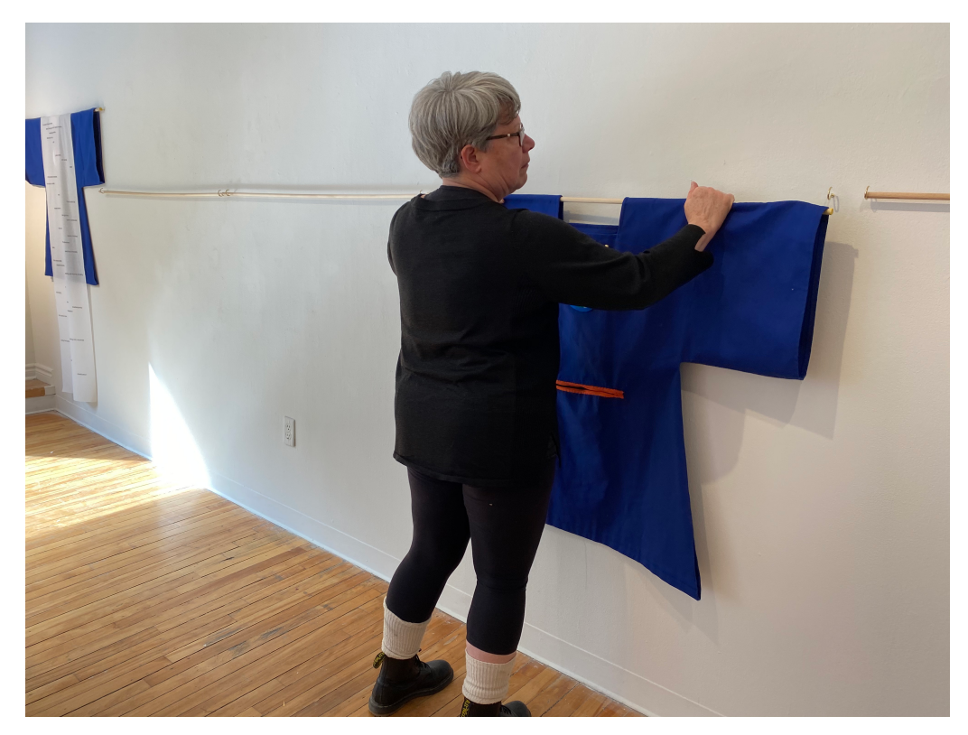
Figure 9. Uniforms for Utopia (2020), installation view March 16.