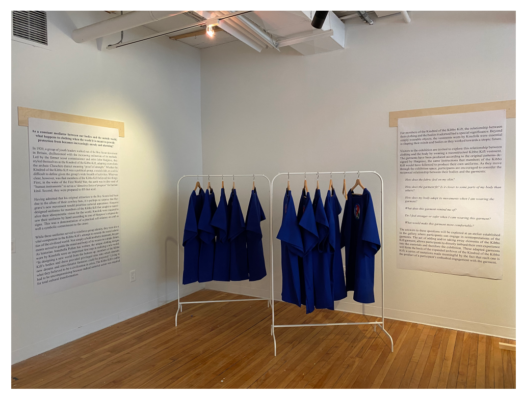
Figure 4. Uniforms for Utopia (2020), installation view March 16.