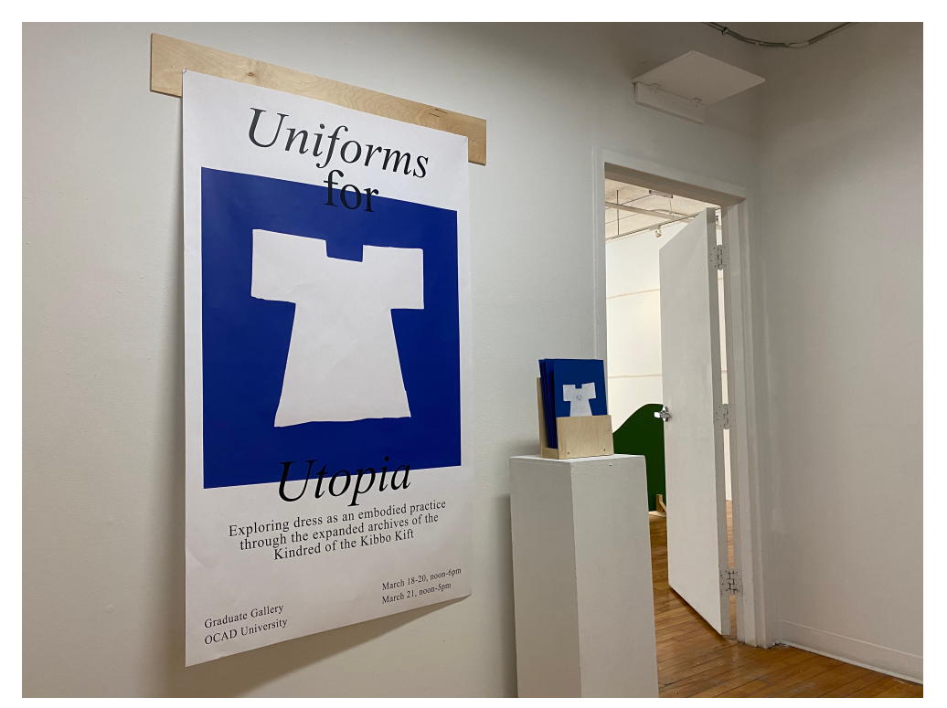
Figure 2. Uniforms for Utopia (2020), exhibition entrance March 16.