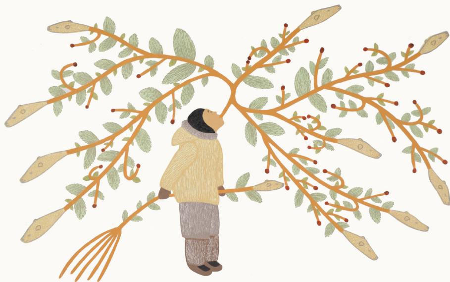
Qavavau Manumie, Arniniq Inuusiq (Breath of Life) , 2017, stonecut and stencil, 24.5" x 31".

territories. In a previous exhibition, Jennifer Rudder noted on the wall label for the work, "A baby fawn, beaver, shrew, coyote, lynx, raven and snow hare, coexist in biological synchronicity that allows for adaptation and survival. Despite their differences, the varied species live comfortably together in a large contiguous habitat, and human stewardship of that habitat is critical to their survival. They hunt, share food in pairs and alliances, and warn each other of danger ahead, in an example of ideal coexistence; a concept that some humans have lost. Barkhouse has stated that fragmentation of people or animals results in isolation, and contributes to the 'snuffing out of a culture.' vi These young creatures are full of potential yet vulnerable and to thrive, a stable ecosystem is needed to nurture them." vi