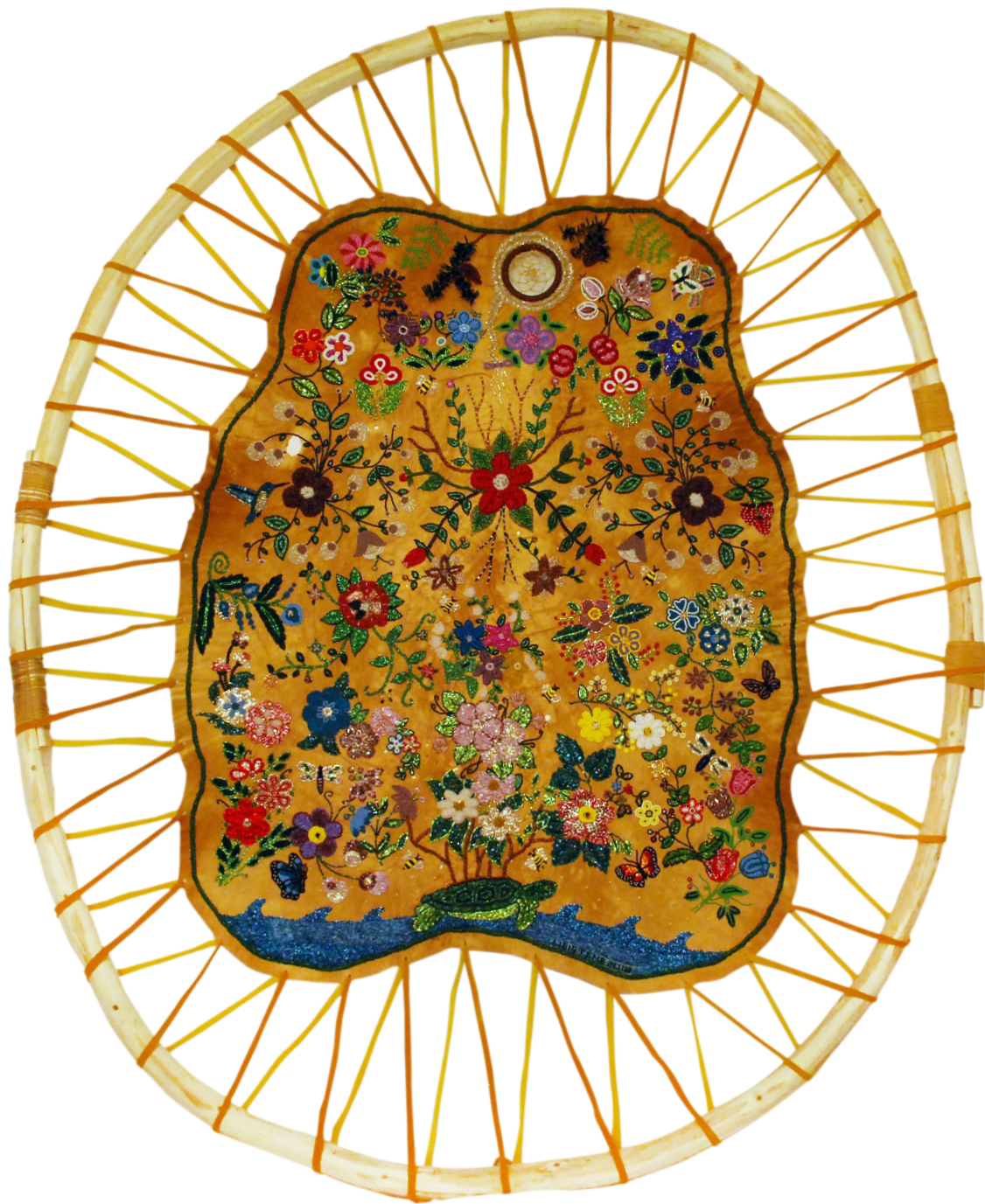
Flora Weistche, My Grandmother's Garden - Nuuhkim Unihtaauchihchikan , 2018, hide of the artist's father's last hunted Caribou, glass beads, thread, wood, 62.75" x 50.75" x 2" unframed.

the materials, the many hours of labour and the energy invested by Weistche, friends, family, plants and animals. Through it, I hear many living things, human and non-human, speaking of the past and the future. I can hear the Caribou continue to speak as it did with Weistche's father years ago.