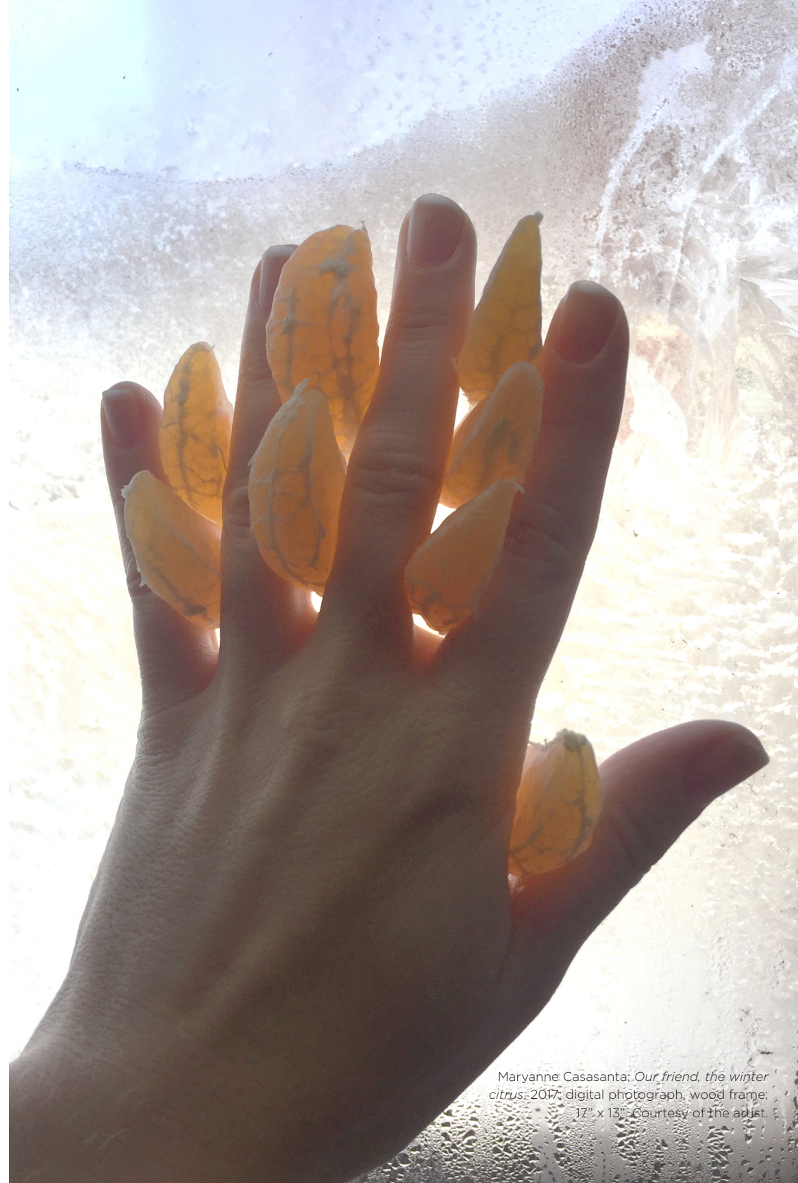
Maryanne Casasanta: Our friend, the winter citrus , 2017; digital photograph, wood frame, 17" x 13", Courtesy of the artist.

Mary Anne Barkhouse's sculptures encourage a shift in perspective as they challenge us to view the rural and urban animals of the Boreal Forest and its southern counterparts through a contemporary lens of survivance. Caribou, Swift Fox and many animals are threatened by the continuing expansion of humans and industry into their habitats whereas; some animals such as Coyotes and Coywolves are thriving. In Empire , young animals of different species cohabit comfortably on lush velvet