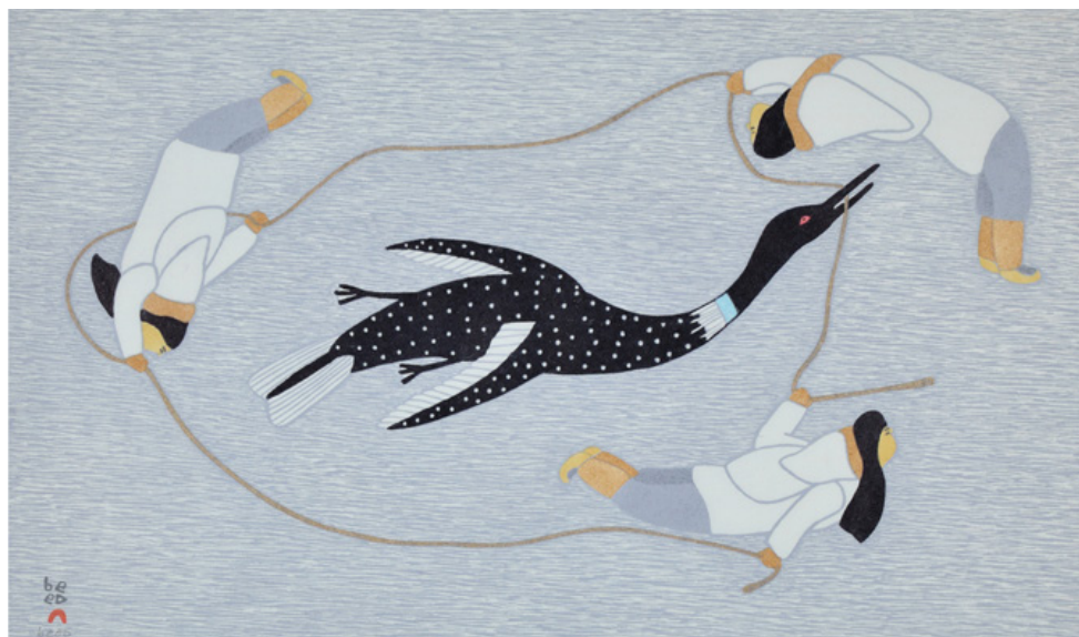
Gavavau Manumie, Chasing the Loon , 2015, stonecut and stencil, 15" x 24".