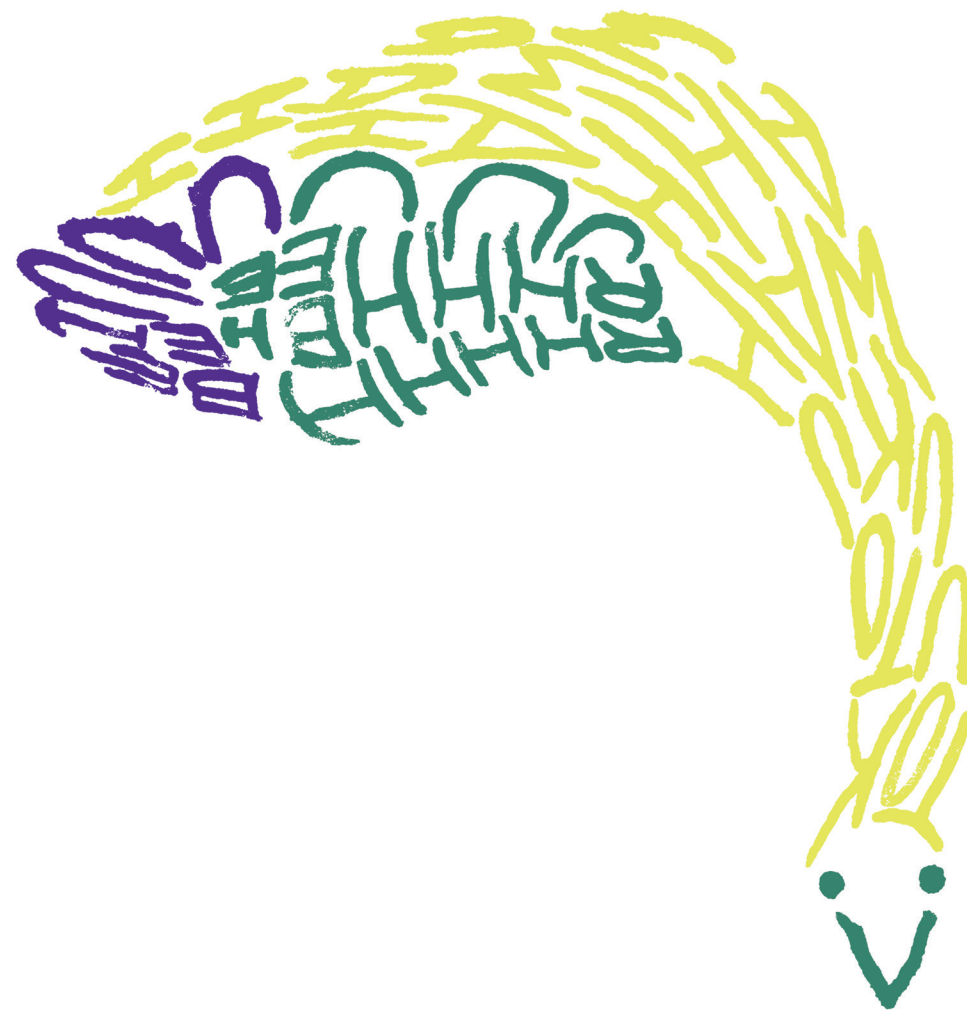
Naufus Ramírez-Figueroa, Concrete Poem Documentation of Bird Séances , 2011 to present, series of five digital prints on Epson coldpress watercolour paper, calligraphy by Lester Mead, 20" x 29.5" each.

vii (April 6, 2018). What Does Indigenous Knowledge Mean? A Compilation of Attributes . [Working Effectively with Indigenous Peoples]. Retrieved November 15, 2018 from: https://www.ictinc.ca/blog/what-does-indigenous-knowledge-mean