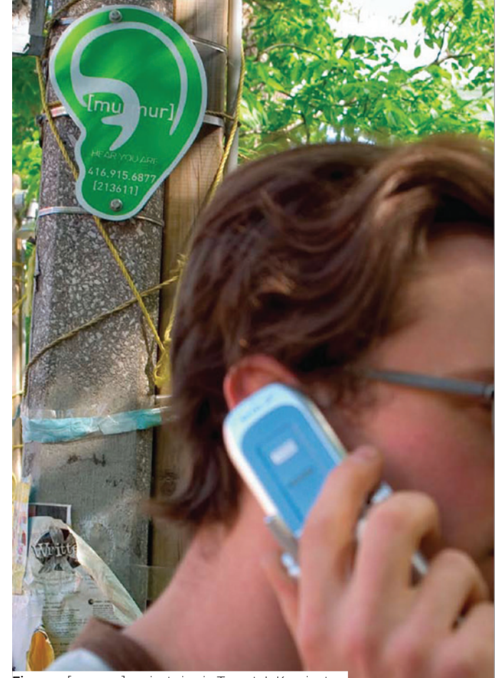
Figure 1. [murmur] project sign in Toronto's Kensington Market, 2007.

The first iteration of the [murmur] project, located in the transitional and diasporic community of Toronto's Kensington Market, started an urban community