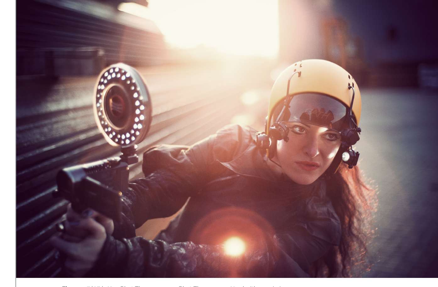
Figure 7. I'd Hide You, Blast Theory, 2012. © Blast Theory, 2012. Used with permission.

Visitors to the Royal Opera House entered a kiosk in which they were greeted virtually by one of the young protagonists of the game, a group of teenagers located across town in Mile End Park in London's East End. Kids waiting in the park responded to operagoers with a text greeting: "Welcome to You Get Me. This is a game where you decide how far to go, now, at this moment. Each one of us has a question we want you to answer..." and then the unsuspecting Covent Gardeners were dropped into the virtual/real game world. As visitors to the East End park they were allowed to choose one of the teenagers, known as runners, as a potential partner in the game. Their choices were