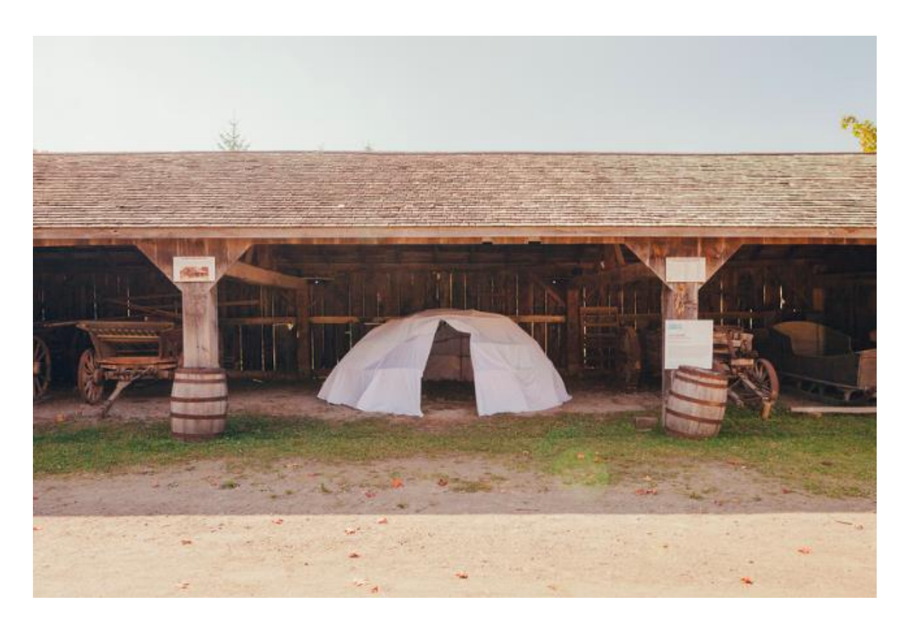
Figure 7. Julie Nagam, singing our bones home , Installation still, Markham Museum, 2013, collection of Will Pemulis