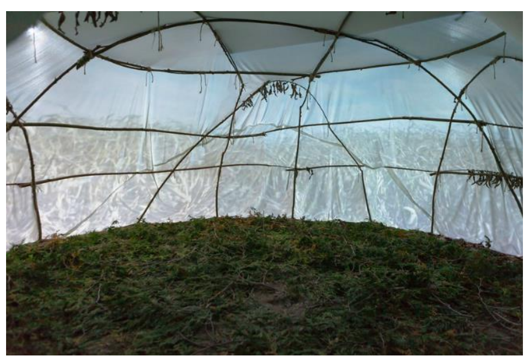
Figure 8. Julie Nagam, singing our bones home , Installation still, Markham Museum, 2013, collection of Will Pemulis