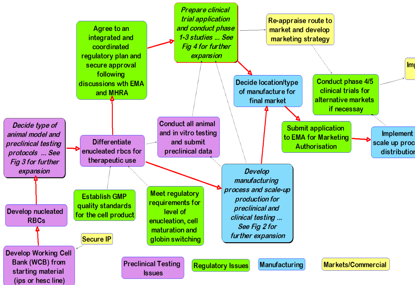
Fig 2 Value chain critical points for production of cultured red blood cells