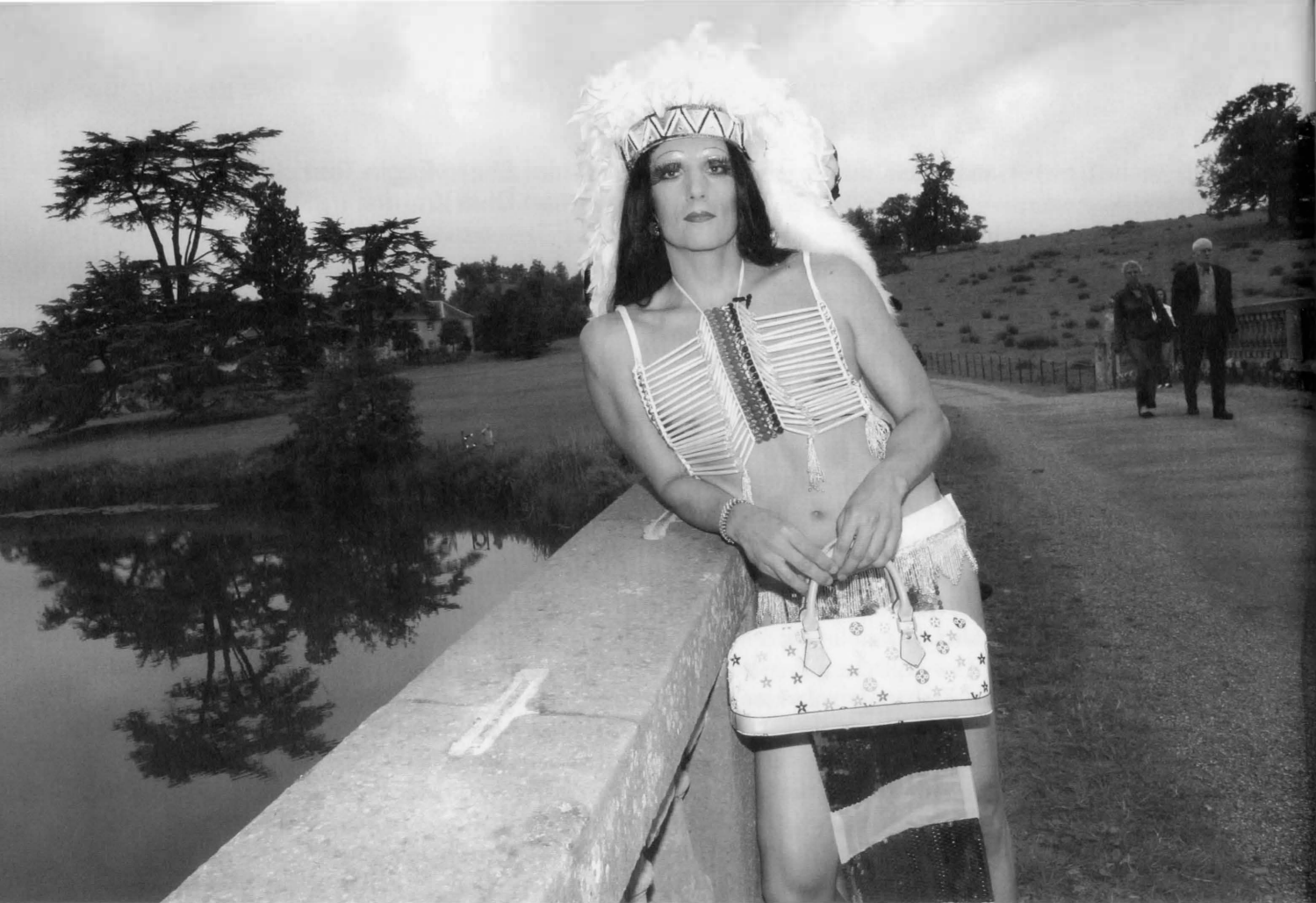
Kent Monkman as Miss Chief Share Eagle Testickle, 2005.

Monkman's simulated transtemporal narrative of queer postindian warrior domination.