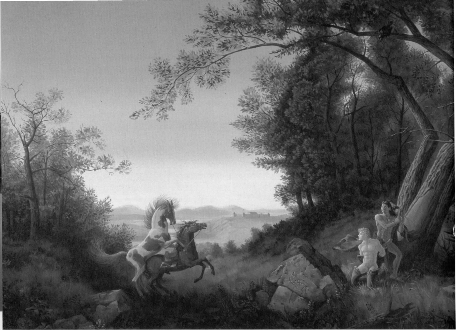
Kent Monkman, Fort Edmonton , 2003.

only image of sexual and gender difference produced by the colonial gaze that Kane then elided in his version. Kane's diaries are equally simulacral, having most likely been written by someone else. Artist and Model also reactivates a range of simulated histories of sexual and gender difference, perhaps most obviously, the martyrdom of the cowboy model cast as the martyrdom of Saint Sebastian, the most notoriously kitsch icon of closeted, sadomasochistic, homoerotic ecstasy. Not surprisingly, the widely accepted representation of the lithe Christian convert Sebastian's death by arrows for refusing the advances of the lecherous pagan Emperor Diocletian is a simulation. Surviving the arrows and continuing to proselytize, Sebastian actually came to a much less elegant end; he was clubbed to death and his body dumped