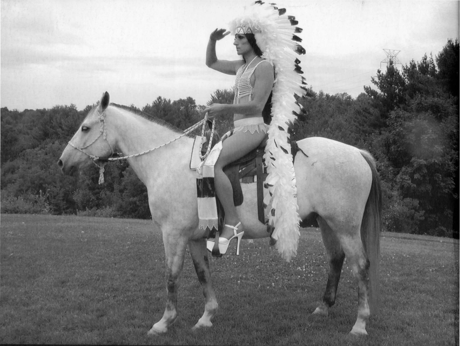
Kent Monkman, Still from Group of Seven Inches , 2005.