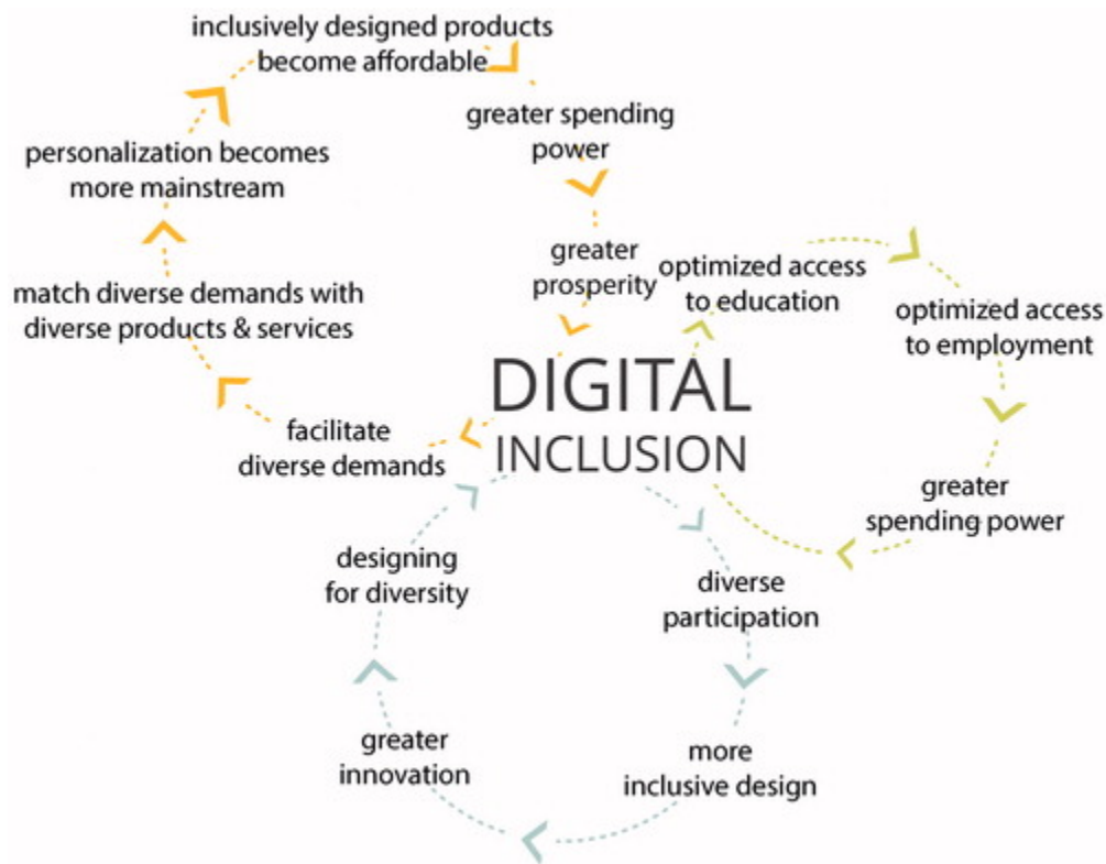
Figure 4. Virtuous cycles of digital inclusion from the IDRC. 12 The three rings illustrate the impact of greater access to and inclusive participation in the design process and the mutual effects of action at the level of the individual, society, and system.

At the edge or at the margins of any population there is far greater diversity. It can be said that the only common characteristic of disability, for example, is difference (Wang, 2015 Wang, M. [Director]. (2015). Inclusive [Motion Picture]. United States: Microsoft Design in partnership with Cinelan. Retrieved from www.inclusivethefilm.com ). Because the dominant trend is to design for the average, typical, or mass audience, this difference causes a mismatch between the needs of each individual and the design of the environment, product, or service, affecting the experience of disability. Our dominant designs similarly exclude other individuals in a minority, whether