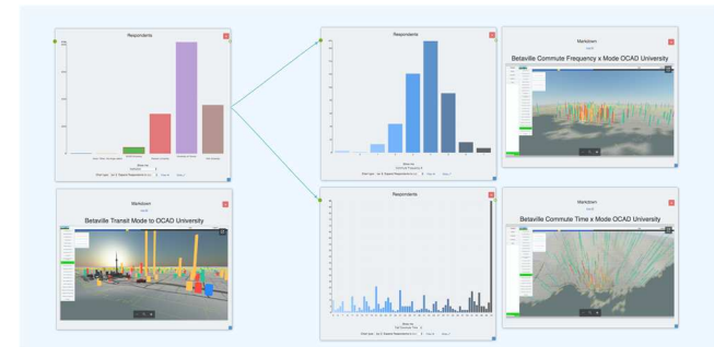
Fig. 3: Each 3D column visualization is coupled with a bar chart, representing the distribution of respondents by institutions with “OCAD University” selected as the subset. This representation illustrates Transit modes, Commute frequency and Commute time for OCAD University students. The bar charts generated in Story Facets give aggregate quantitative information, while the 3d visualization gives a corresponding spatial understanding, therefore enhancing the qualitative dimension of the data.

Betaville's interactive 3D spatial navigation of vertical bar graphs as an overlay on a map of the city provided for improved legibility and pattern recognition for expert and non-expert users alike: the very different patterns of travel distance and mode choice between the participating schools could make it immediately clear that the challenges are very different from institution to institution. The aggregate data reveals pattern trends at the municipal level, where the information is relevant to zoning and land use near the schools, and to transit planning across the metropolitan region. Blending 2D cartographic representation and interactive 3D infographics captured the information value of both types, without distorting either. [Fig. 2].