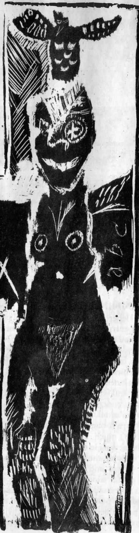
Illustration: Marcia Cannon

Community education, drastically cut in 1983, continues with efforts by