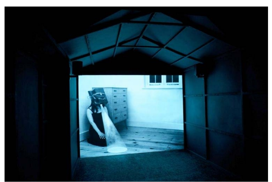
Figure 12. Lindsay Seers, Interior View of Extramission 6 (Black Maria) with still of Seers as projector, 2009, courtesy of the artist.