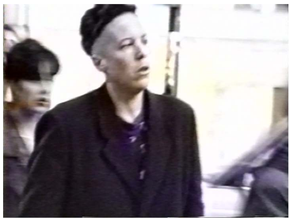
Figure 5. Cathy Sisler, Aberrant Motion #4, 1993, courtesy of VTape, Toronto, ON.