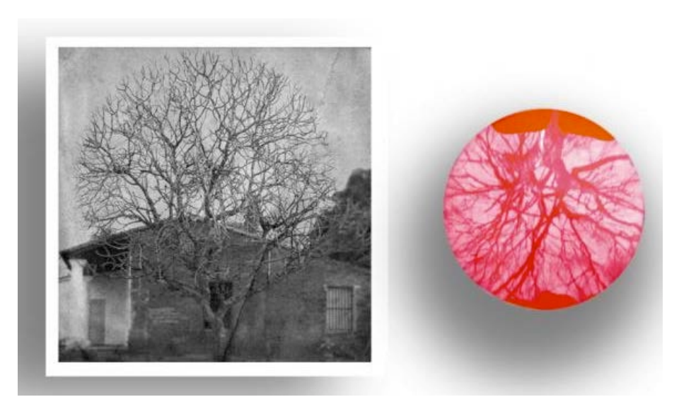
Figure 10. Lindsay Seers, photograph with mouth photograph counterpart, 2009, courtesy of the artist.