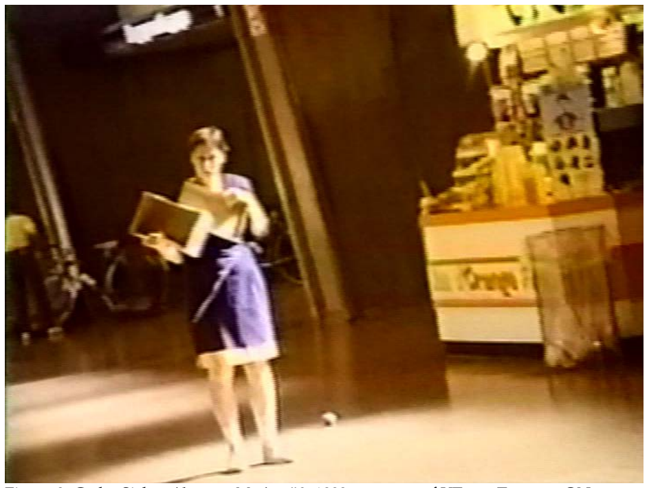
Figure 3. Cathy Sisler, Aberrant Motion #3, 1993, courtesy of VTape, Toronto, ON