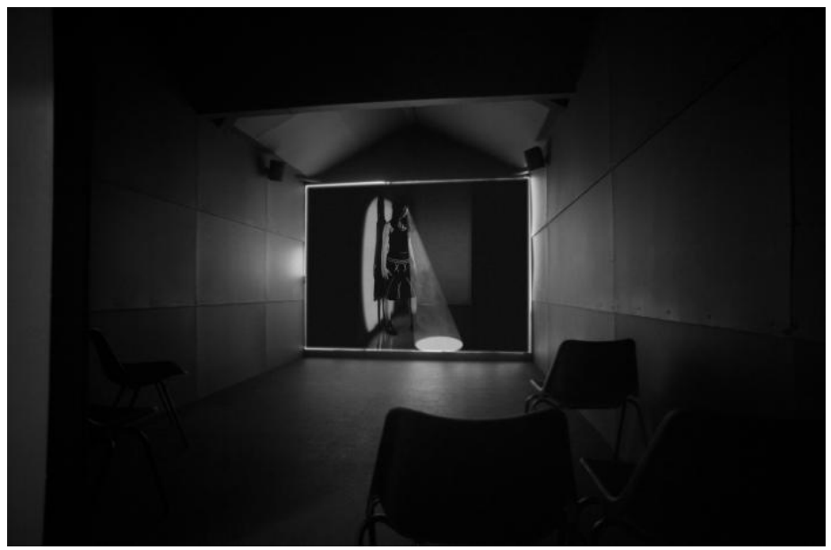
Figure 11. Lindsay Seers, Interior view of Extramission 6 (Black Maria) with still of Seers as projector, 2009, courtesy of the artist.