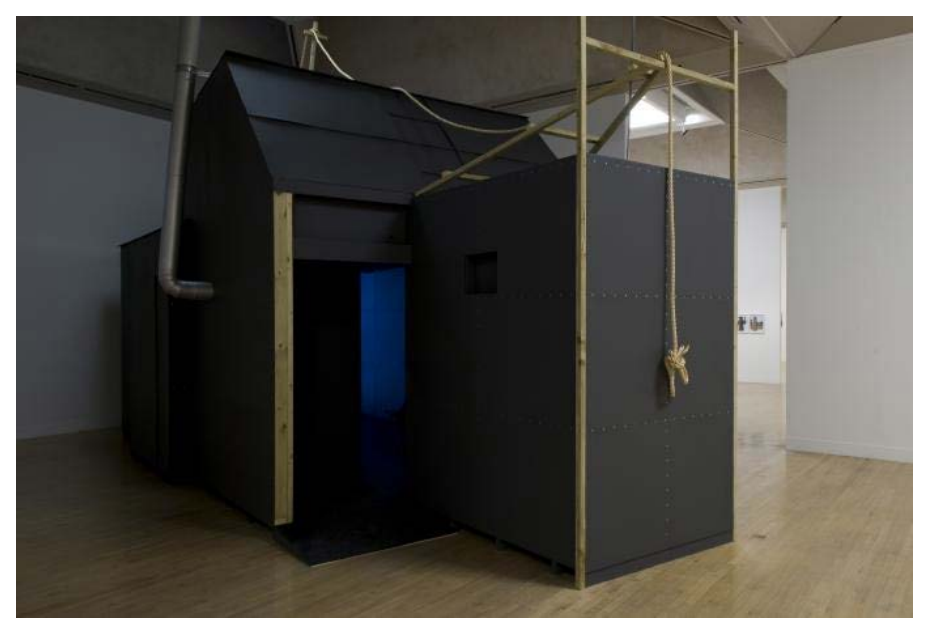
Figure 9. Lindsay Seers, Installation view of Extramission 6 (Black Maria) at Tate Modern, London, 2009, courtesy of the artist.