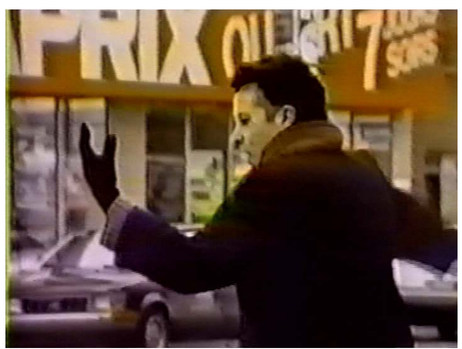
Figure 4. Cathy Sisler, Aberrant Motion #1, 1993, courtesy of VTape, Toronto, ON.