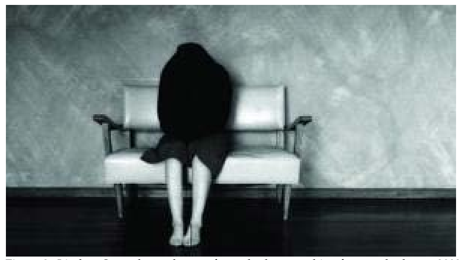
Figure 8. Lindsay Seers shows the act of mouth photographing for mouth photos, 2009, courtesy of the artist.