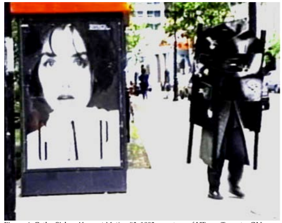
Figure 6. Cathy Sisler, Aberrant Motion #2, 1993, courtesy of VTape, Toronto, ON.