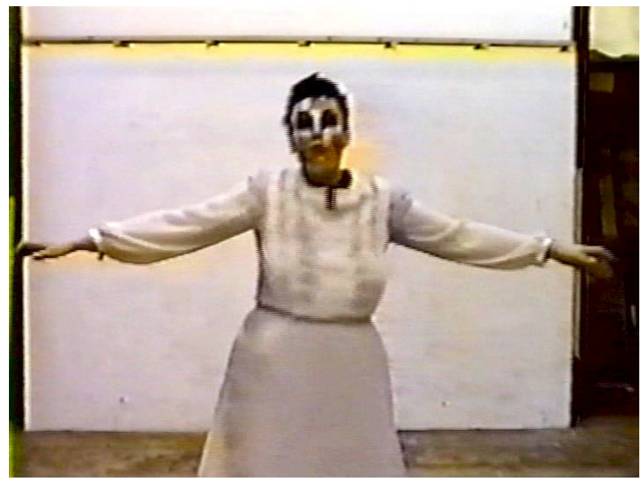
Figure 1. Cathy Sisler, Aberrant Motion #1, 1993, courtesy of VTape, Toronto, ON.