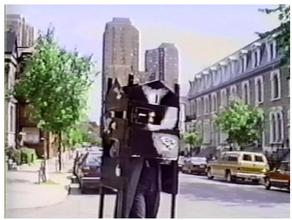
Figure 2. Cathy Sisler, Aberrant Motion #2, 1993, courtesy of VTape, Toronto, ON.