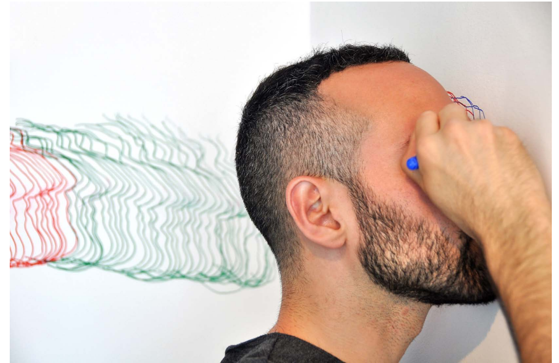
Above and following pages: Views of portrait, close-up, trace from spatial profiling . . . Performed for Mayworks, Festival of Working People and the Arts, Toronto, 2013. Three-hour performance and site specific drawing, dimensions variable. Marker on wall.