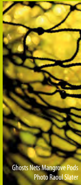
Ghosts Nets Mangrove Pods