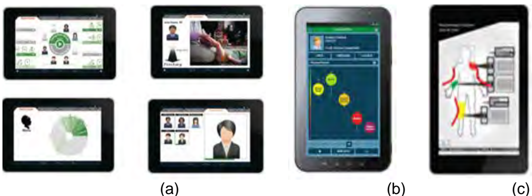
Figure 1: Prototypes designs: (a) Metas da Marta (b) Corpose and (c) Procare

Following our first observational work and preliminary prototype development we returned to the CAIS and led a workshop that reviewed the prototypes and gathered feedback for a second round of design. The second design, entitled the Care and Condition Monitor , was founded on a "care and condition" strategy, which appeared to be valuable to many long-term care contexts, not only that of the CAIS, and could potentially involve families or care recipients. It would enable workers to capture longitudinal data from informal data sources and to visually analyze the condition of residents.