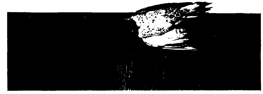
Abbas Akhayan Northern Flicker I from the series Fatiques) 2014 Taxidermy animals. Installation view at the Musée d'art contemporain de Montréal

how the pieces speak to one another, and whether they reduce one another into a thematic about "dealing with atrocity," or if they open up the potential for more complex meanings. But I think it's really