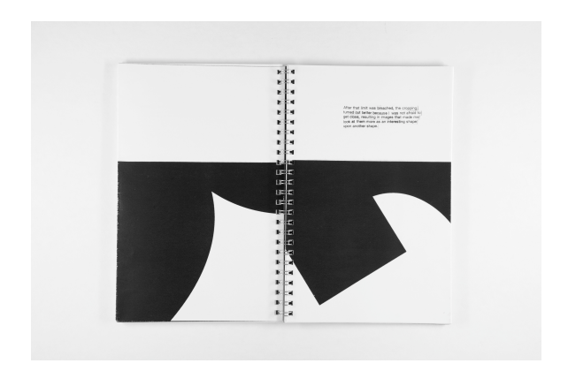
Fig. 3. Though primarily a reflective project, the students still produce formally engaging documentary work that serves to further their sense of sustaining their process after the 'real' project work of the semester.

While students might recognize the work of the Observations project to be posthumous or after-the-fact, it remains a significant activity to consider the documentation and reflection on one's process as worthy of the same attention afforded the previous project work of the semester. The basic sequential form of a book constructed through paste-up techniques, in contrast to a blog or wiki engages students in the physicality of language and its implications. The confrontation between designer and material