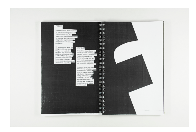
Fig. 2. Formal + verbal associations are here made visible between the ragged edge of paste-up typography and a single cropped letterform.

language and commentary. As each sentence is composed of paper fragments, brevity becomes a welcome strategy.