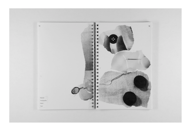
Fig. 4. Initial understandings of communicating sequences and series become evident in a rough unscripted collage – paste-up allows for the intuitive assemblage that initial experiences with digital tools often overpower with demands of technical skill.