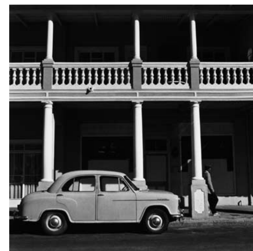
Roger Ballen, Oblivious , 2003 / Roger Ballen, Indonesia , 1979 / Roger Ballen, Side view of hotel, Middleburg , 1983.