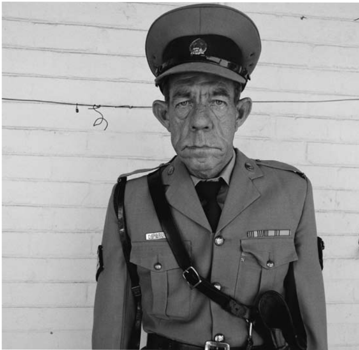
Above: Roger Ballen , Sgt. F. de Bruin, Department of Prisons Employee, Orange Free State, 1992 . Front and Back Cover Images: Roger Ballen , Boarding House, 2008 , (details); (Courtesy the artist and Clint Roenisch Gallery)