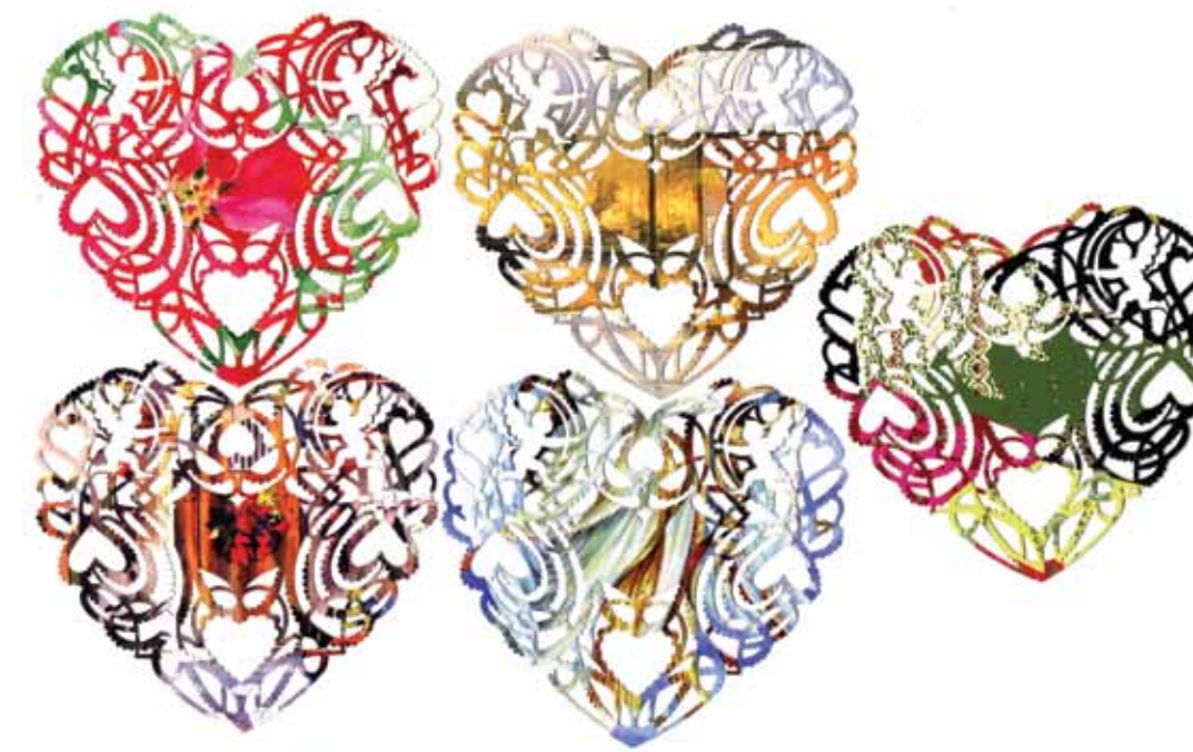
RIGHT: VALENTINES, 2010 VECTOR/LASERCUT