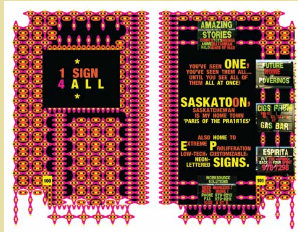
LEFT, RIGHT & BOTTOM: I WONDER, 2010 SPREADS FROM BOOK