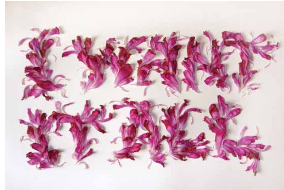
COVERS: I WONDER, 2010 FULL COLOUR PLUS GOLD HARDCOVER BOOK