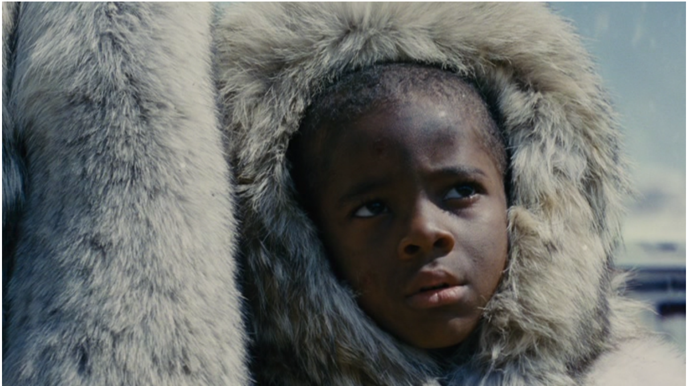
Figure 11 - Whose is the face of extinction?

As in several of the films discussed in this chapter, human confrontation with extinct species (whether already extinct, soon-to-go, or about-to-come-back-to-life) is not uncommon in Anthropocenema. However, Snowpiercer hints at a possible reversal in the dynamics of the scenario, which evokes cosmic stakes but often focuses attention or affective energy on the human as the species that must act, or mourn, or walk away.