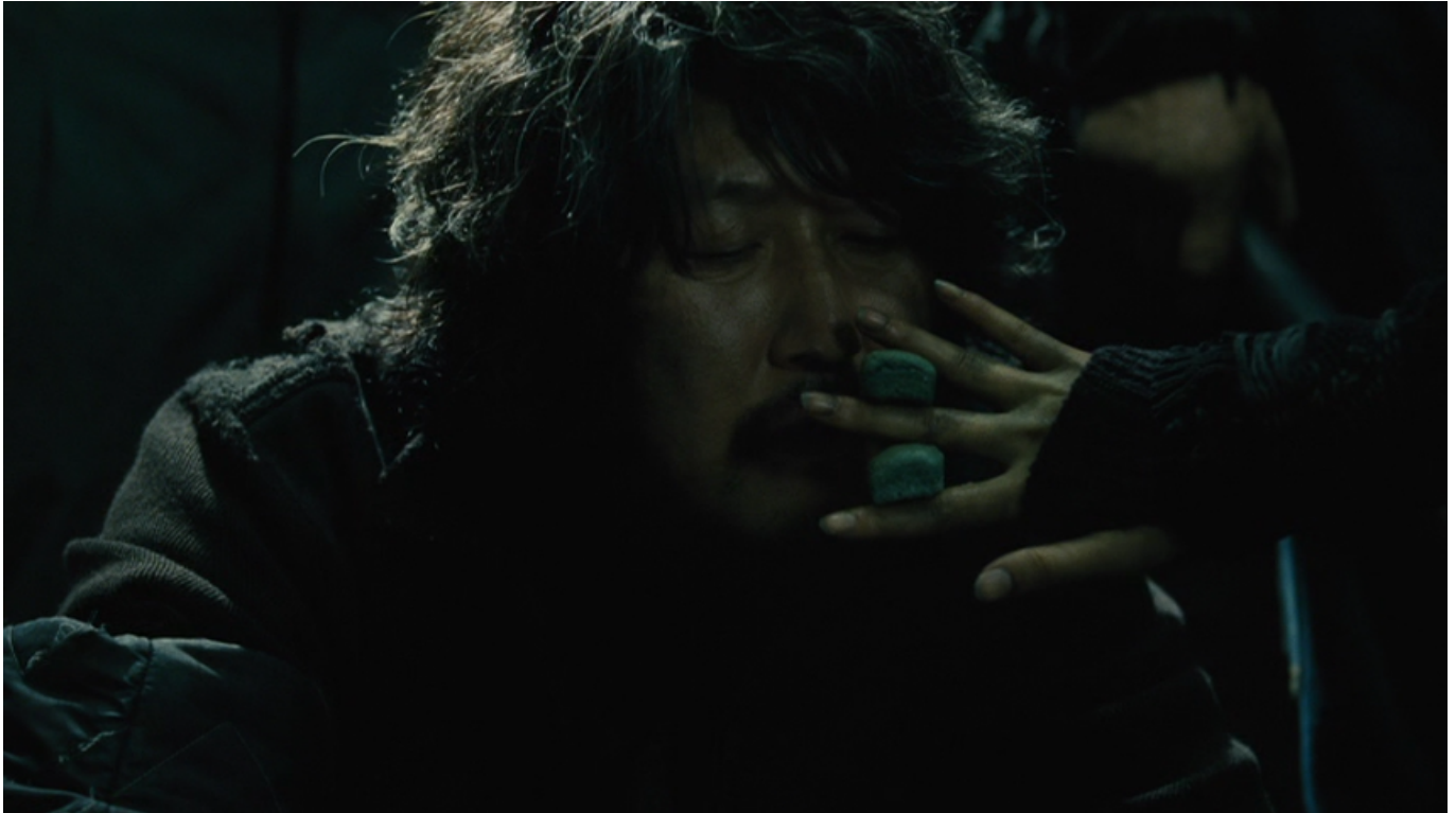
Figure 6 – Industrial waste as opiate and revolutionary force in SNOWPIERCER (2013)

Loosely based on the French graphic novel Le Transperceinage , the film's mise-en-scène is evocative of techno-industrialism: humanity, or what's left of it, is tethered to a high-speed train that races ceaselessly around the globe on a circular track, powered by a perpetual-motion engine. The train functions like a carefully bio-engineered miniature ecosystem, the population of which is divided into distinct hierarchical categories, reminiscent of both social Darwinism and Marxist class structures. The upper classes, it would seem, have no intention of trying to find a solution to the technoscience-induced ice age; instead, they merely impose further technofixes to prevent imbalances in the train's ecosystem, recalling contemporary capitalism's stopgap responses to global ecological problems. The lower classes, who reside in the tail section of the train, rise up against the oppressive regime, but their attempt to co-opt it eventually fails; the male protagonist Curtis's heroic idea of taking over the train turns out to have been anticipated all along—programmed, in fact, by the system itself, which regards the deaths occasioned by periodic revolts as an effective means