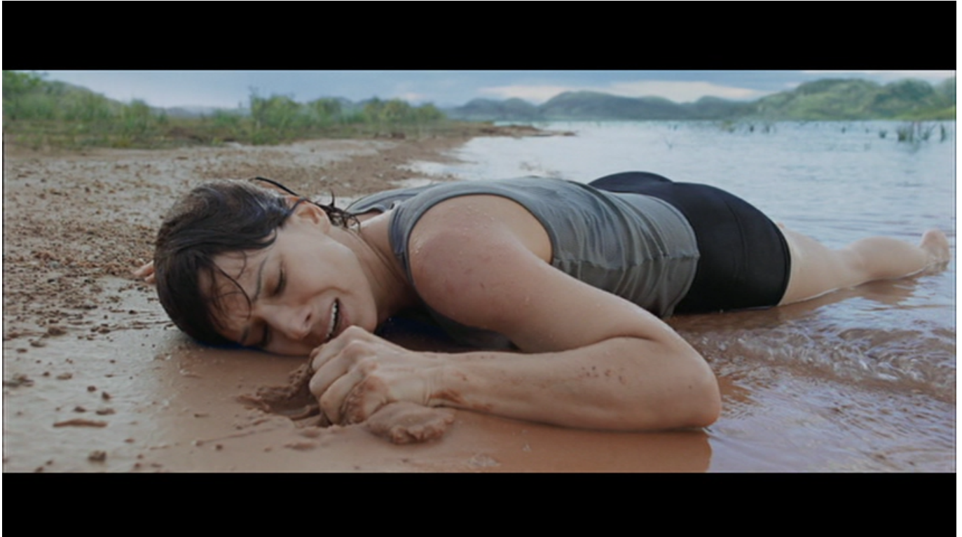
Figure 2 - Emerging from the “primordial soup”

After a couple of trials, she succeeds in standing upright, which symbolizes her regained will to survive and evokes the primal scene of evolution. As the director describes in an interview: