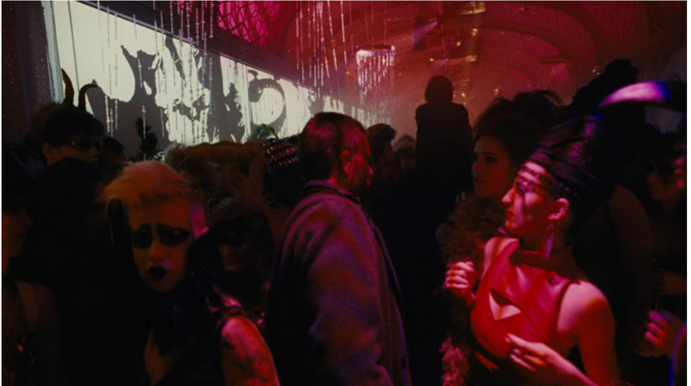
Figure 8 – Rave parties at the end of the world

The waste-derived drug pacifies the youth in the front sections (resonating with the contemporary fascination and intoxication of consumer capitalism, which manufactures species-threatening waste on a planetary scale), but it also helps kickstart the revolt in the tail section and ultimately leads to the destruction of the train at the end of the film. Waste is therefore a liminal object and a world-historical event, with the name Kronol evocative of chronos , time or duration. Its lingering or long-lasting presence, much like the satellite waste in Gravity , causes a spatio-temporal disorientation, a hallucinogenic effect that blurs the distinction between what is disposed of and what endures. The becoming-cinematic of waste is the becoming-cinematic of the Anthropocene's temporality; accordingly, and appropriately, the aesthetic of disposal involved in waste's cinematic representations leaves the viewer feeling profoundly adrift.