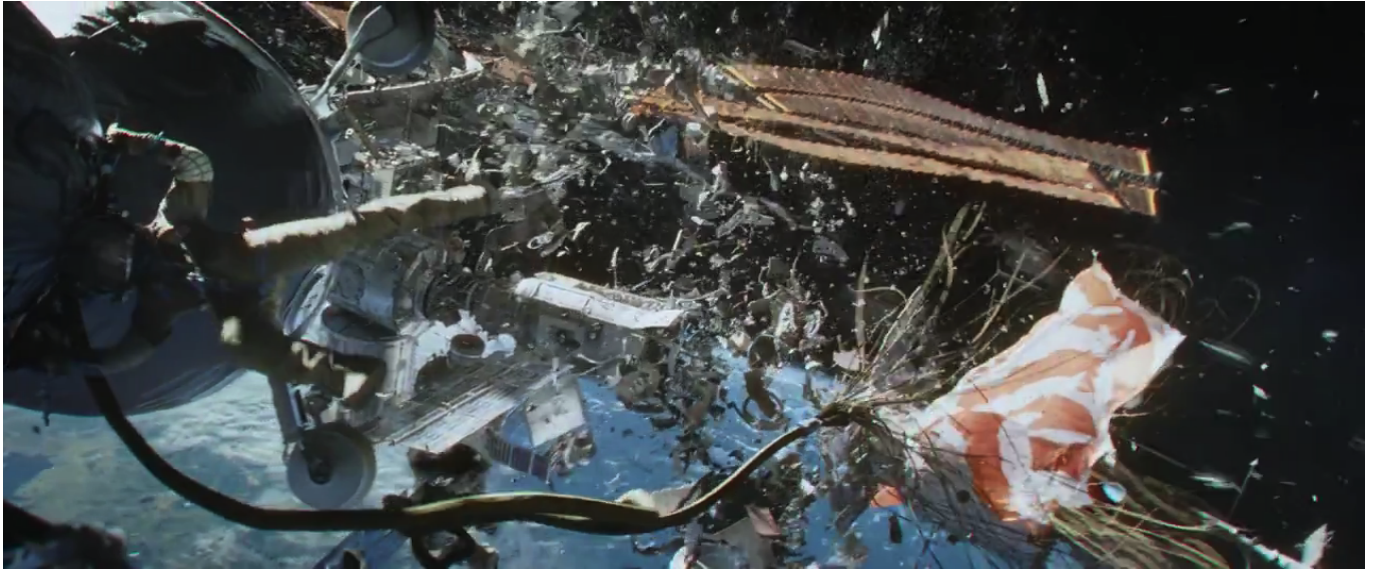
Figure 1 - Space debris as 21st-century villain in GRAVITY (2013)

In the same year, techno-industrial waste made another center-stage appearance in South Korean filmmaker Bong Joon-ho's international sci-fi film Snowpiercer (2013), this time as an anarchic agent of revolution. Snowpiercer depicts the class struggles among the survivors of an accidental ice age triggered by a human experiment aimed at counteracting global warming, but which left the remnants of humanity confined to the claustrophobic space of a train ceaselessly circling the globe. The cruelty of the technofixes put in effect in order to maintain the carefully bio-engineered mini-ecosystem on board the train eventually lead to a revolt. The revolutionary cause calls for extreme measures, thus prompting one of the main characters to fashion a bomb out of the highly addictive and also highly combustible drug Kronol, which is made of industrial waste. The bomb annihilates (almost) everyone aboard the train—which is to say: nearly all of humanity.