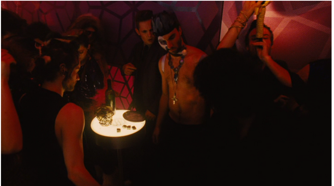
Figure 7 - Industrial waste as intoxicant of choice among the privileged classes