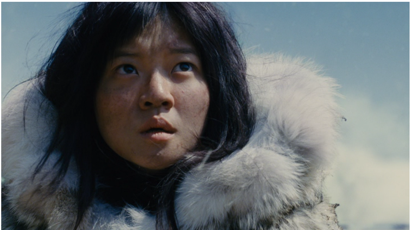
Figure 9 - Yona looking at extinction

to bring about humanity's second near extinction—leaving her and a 5-year-old boy as the only survivors. Only thus, apparently, is it possible to escape the ineluctable trajectory of the system (the system of the train, of capitalism and social oppression, or of techno-industrial destruction and environmental desolation). The last scene of the film shows the female survivor Yona, standing in front of a burning train, buried in ice and snow, and looking pensively at a polar bear glancing back at her, immediately recognizable as the inevitable victim of the 21st century's already underway mass extinctions (Figures 9-11).