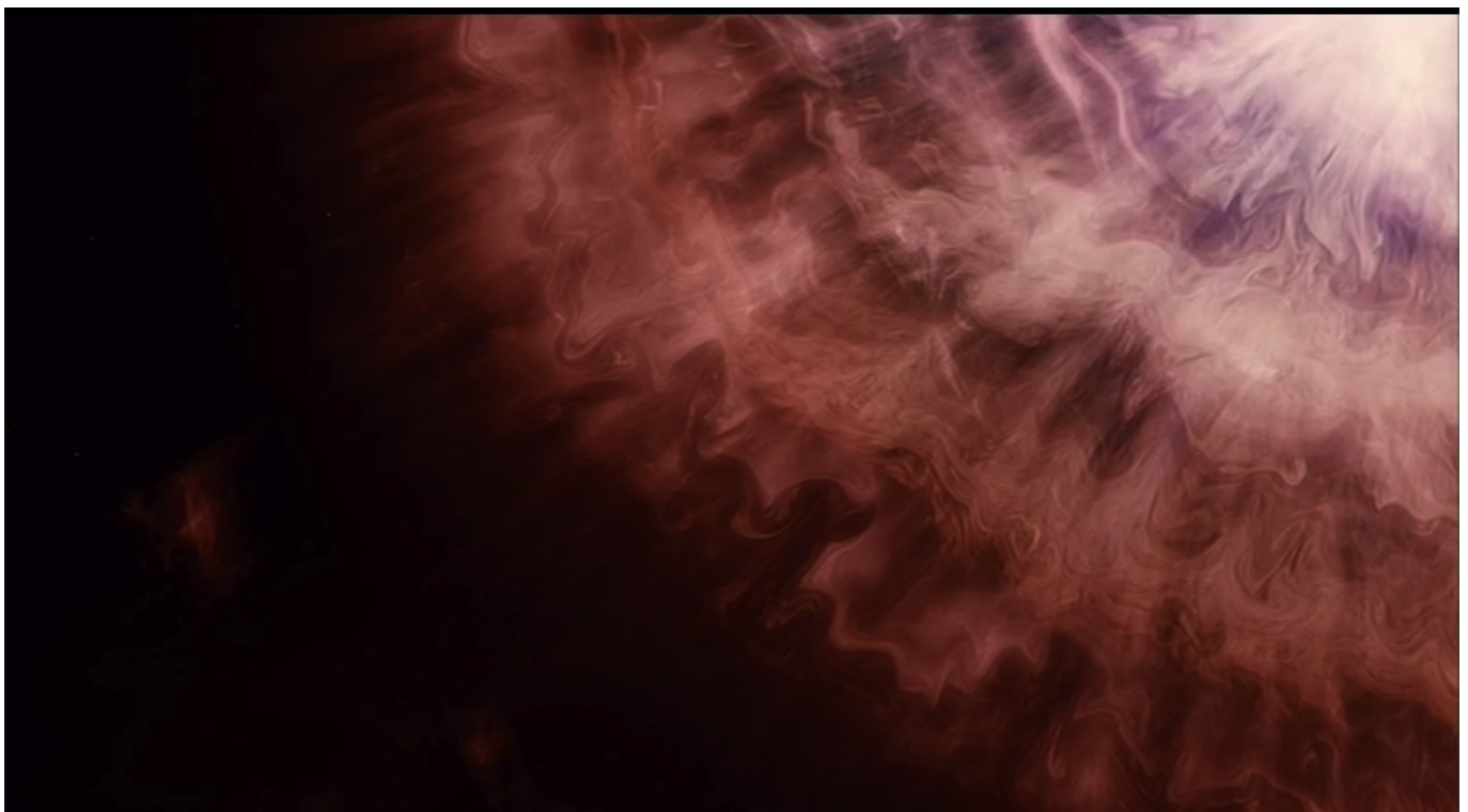
Figure 3 - Cosmic "lunia compositions" in THE TREE OF LIFE (2011)

In a twenty-minute montage sequence, Terrence Malick's period piece on a family's emotional struggle with the death of their son takes a detour to depict the creation of the universe and primordial forms of life on earth leading up to the dinosaurs. The sequence opens with the grieving mother's voiceover, pleading to God. "Lord, why?" she asks, "Where were you?" There seems to be a (troublingly gendered) nature vs. grace tension between the characters in the film, in which the mother, with her connection to God, represents the way of grace. She is nurturing, compassionate, and spiritual, unlike her second son Jack and her husband, who represent nature's more merciless, competitive, and volatile forces. Her voiceover is coupled with footage of "lunia compositions" (a name given these images by light artist Thomas Wilfred, whose work features experimental light effects) recalling the third verse of the Book of Genesis, "Let there be Light" (see Figure 3).