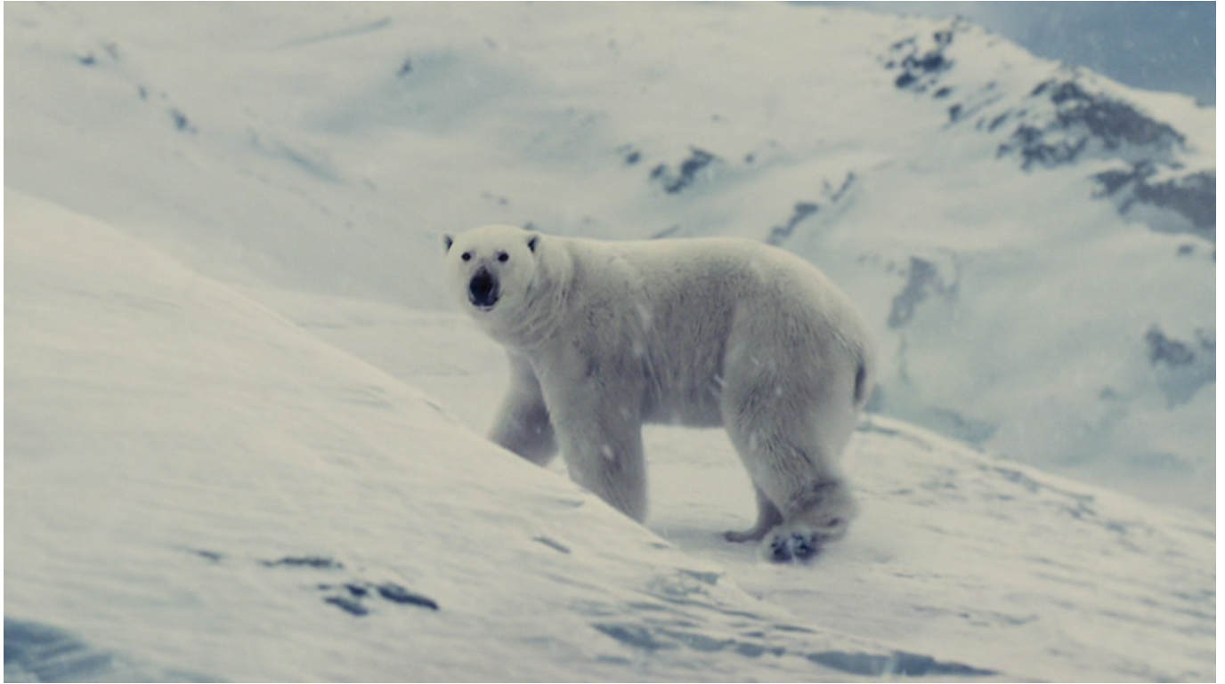
Figure 10 - Facing extinction?