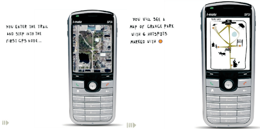
Figure 2: An aerial view and corresponding map showing GPS hot-spot locations of the audiovisual narrative sites selected for the Park Walk Project in Toronto’s Grange Park

A feature of the Park Walk application is a pictorial identification system for the local flora and fauna, installed on the mobile phone (Figure 3A). A far cry from a didactic “field guide,” the identification system lays a veil of relevant information over the geographic area, rooting it firmly to the locale and to specific locations of interest. Building on this innovation, games that would appeal to a younger audience involving the identification of flora and fauna in the park