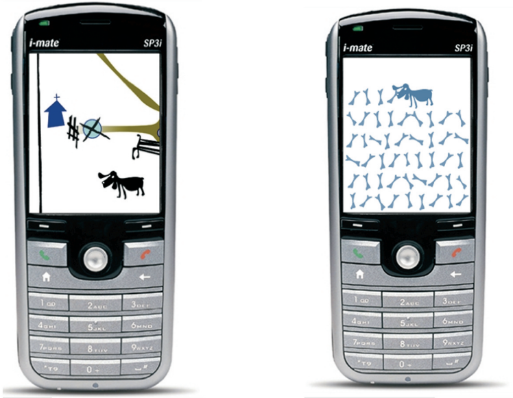
Figure 4: Dog-counting “zapper” game designed for Grange Park

An interactive demonstration of these and other features of the Park Walk Project application can be found online at the OCAD Mobile Experience Lab website. 9 The Park Walk illustrations were created by student research assistant Nevena Niagolova.