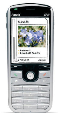
Figure 3B: Flower identification and counting game