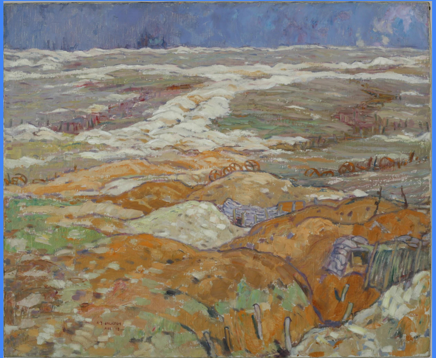
Trenches Near Angres. A.Y. Jackson. Beaverbrook Collection of War Art:

https://www.warmuseum.ca/firstworldwar/objects-and-photos/art-and-culture/official-art/?target=1855