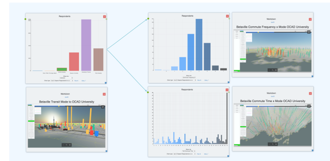
Fig. 3: Each 3D column visualization is coupled with a bar chart, representing the distribution of respondents by institutions with “OCAD University” selected as the subset. This representation illustrates Transit modes, Commute frequency and Commute time for OCAD University students. The bar charts generated in Story Facets give aggregate quantitative information, while the 3d visualization gives a corresponding spatial understanding, therefore enhancing the qualitative dimension of the data.

Betaville's interactive 3D spatial navigation of vertical bar graphs as an overlay on a map of the city provided for improved legibility and pattern recognition for expert and non-expert users alike: the very different patterns of travel distance and mode choice between the participating schools could make it immediately clear that the challenges are very different from institution to institution. The aggregate data reveals pattern trends at the municipal level, where the information is relevant to zoning and land use near the schools, and to transit planning across the metropolitan region. Blending 2D cartographic representation and interactive 3D infographics captured the information value of both types, without distorting either. [Fig. 2].