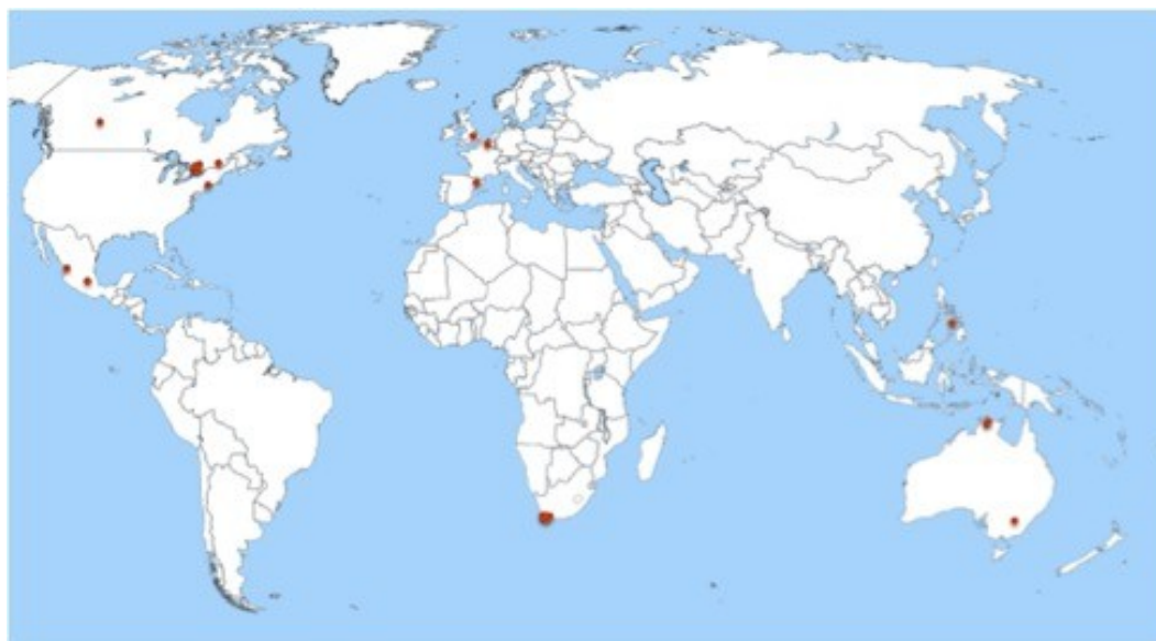
Figure 2: Geographical location of body-mapping articles included [15]

A summary of the 22 included articles representing 19 discrete studies is presented in Table 1. The year of publication ranged from 1992 to 2015. In terms of countries where body-mapping was conducted, Canada (n=7) and South Africa (n=4) featured prominently, followed by Australia (n=3), with remaining projects in the United Kingdom, Philippines, Mexico, and Belgium. One study spanned the United States, Mexico and Spain (SWEET & ORTIZ ESCALANTE, 2015). Of the 19 original studies, 15 incorporated the actual visual images of the body-maps in the article or book chapter.