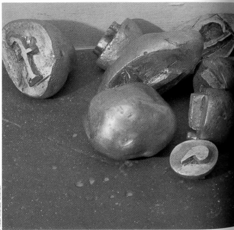
ABOVE LEFT: MARK GOMES , Perfect World (1989–90) Laminated colour laser prints, mixed media, 98x120x26 in

The moment is one of precognition: an interior that mocks its designated space, a falling star, a fish that is no fish, a squiggle of a line that marks a line like no other: "Later on, other shapes will begin to stir. Little by little they will not imitate us.